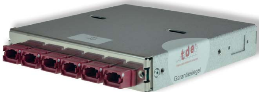
2 The use of idle fibers in a 40 GbE network means that the four rear MTP connectors feed into six front MTP connectors.

To ensure that all fibers achieve the same high level of performance, the fiber height should be as uniform as possible. Practical experience shows that the limits specified by the IEC of 500 nm as the maximum height difference between all fibers and 300 nm as the maximum height