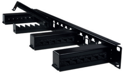
Panel with 4x cable guide holders