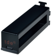
Cable guide holder