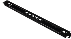
Panel with 2x cable entries and brush strips