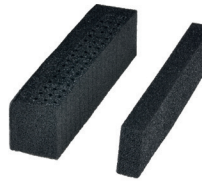
Foam insert 48 cut-outs Ø 1mm