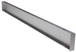
Cover for Panel